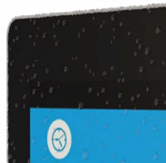
The front panel is IP65 Rated

Step 3. With a fresh Wipe, clean the rear of the AIO PC (the rear panel is IPX2 rated). To clean the screen of AIO PC for general house keeping - use either a microfibre cloth with an alcohol based cleaning spray (approx. 70% alcohol) or disposable alcohol based cloth.