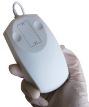
Antibacterial Medical Laser Mouse MT105

* Please read this user manual carefully before you start using this product.